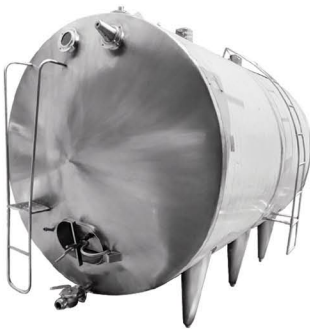
Milk Storage Tank