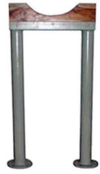
Can Tipping Bar