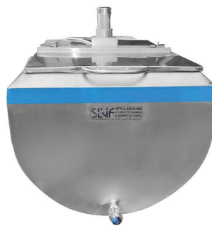
Bulk Milk Cooler