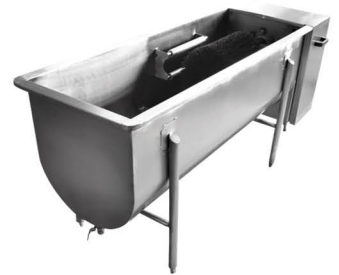
Milk Can Scrubber