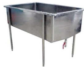
Can Lid Wash