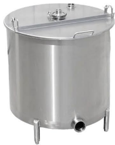
Ghee Balance Tank