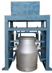
Can Lid Opener