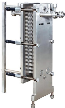
PHE (Plate Heat Exchanger)