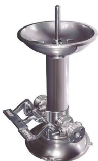
Can Steaming Block