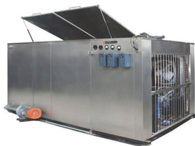
IBT (Ice Bank Tank)