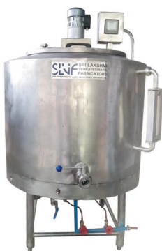
Batch Pasteuriser (Burner Type)