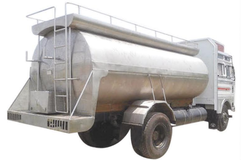
RMT - Road Milk Tanker