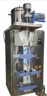
Pouch Packing Machine