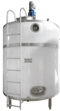
VMST - Vertical Milk Storage Tank