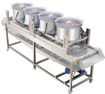
Cooling & Drying Conveyor