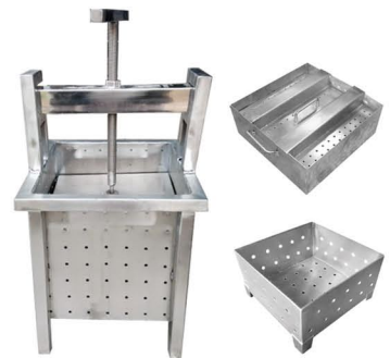
Paneer Press (Manual)