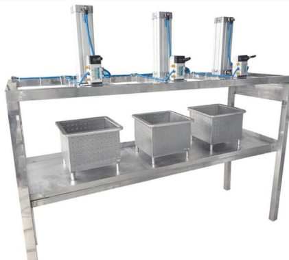
Paneer Press (Pneumatic)