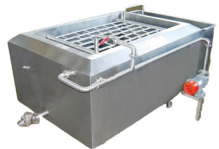
Butter Melting Vat