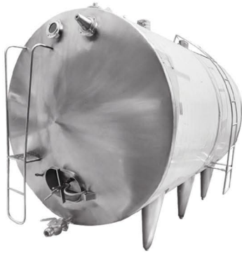
HMST - Horizontal Milk Storage Tank