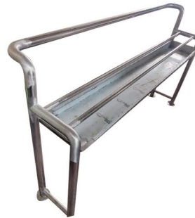
Can Drip Saver