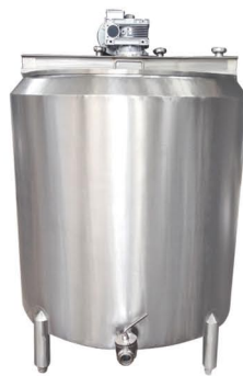
Milk Cooling Tank