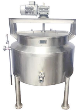
Ghee Storage Tank