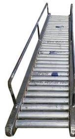
Gravity Roller Conveyor