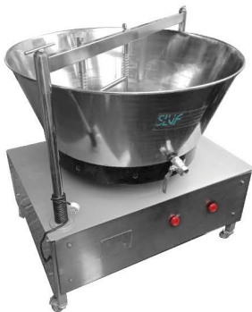
Khova Making Machine