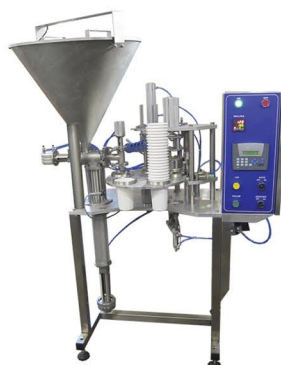
Cup Filling Machine