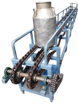
Milk Can Conveyor