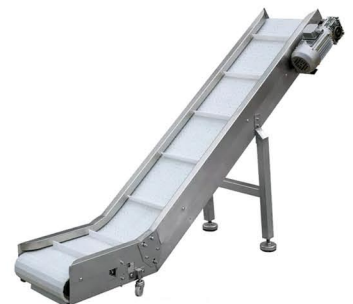
Inclined Belt Conveyor